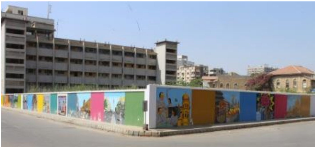
Boundary wall of H J Rustomjee Bagh

Art is often misrepresented as a commodity or a form of luxury; the truest form in art is actually in the accessible nature and social commentary of it. The Walls of Peace initiative aims at bringing art to public spaces in Karachi which can fuel a greater sense of appreciation over how creativity can nurture positivity and hope. Funded by I AM KARACHI and implemented by Vasl Artists' Collective, The Walls of Peace project have created murals at Cantt Station, Governor's House, M T Khan, Hoshang Road and are currently in process at H J Rustomjee Bagh and Press Club.