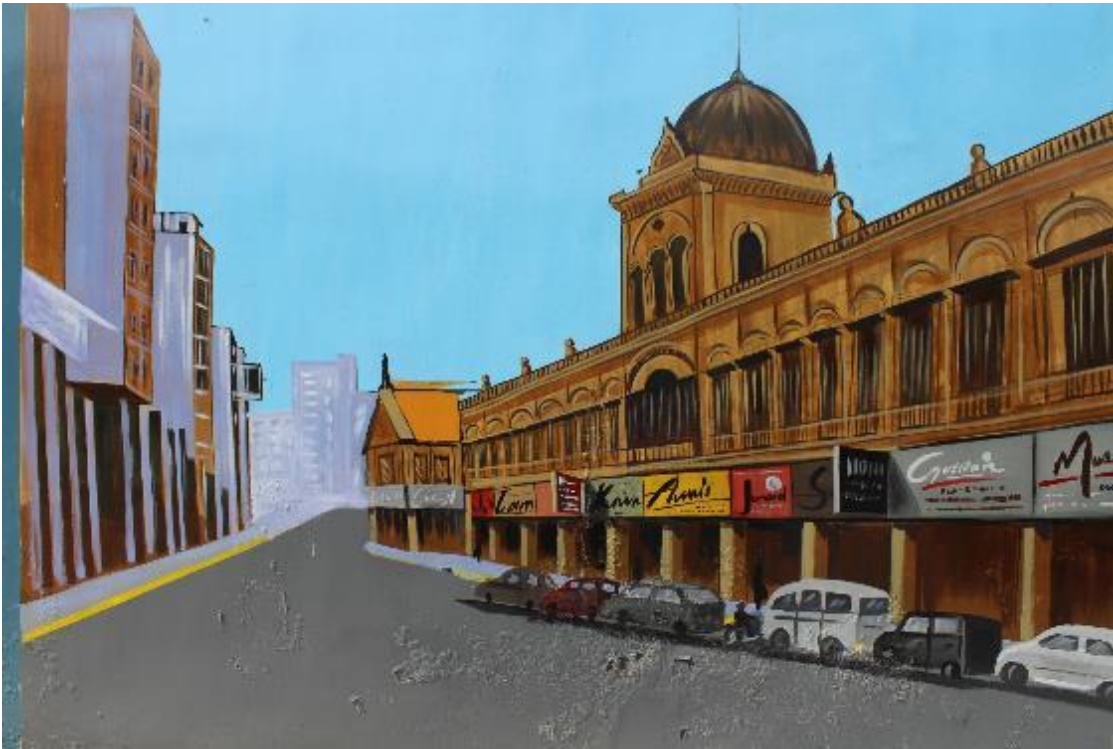
An artist's view of intended Zaibunissa Street uplift