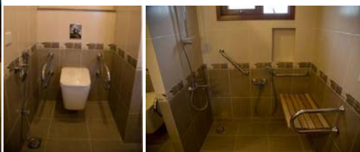
with attached bathroom

Arman is in a colony where largest number of our community resides. KZBM seeks their thought and involvement, as much as of every member of the community, to make the residents happy and cared for. Feel free to take a resident along with you when you take your evening walk. Send your children to KZBM's Sunday Open House to delight the elders, walk-in with a movie to show the residents, or perhaps play a card game or other.