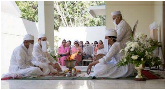
Thanksgiving Jashan for the Arman Home