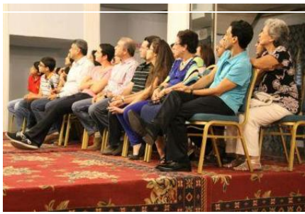
Some of the participants